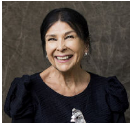
Alanis Obomsawin C.C., G.O.Q., C.A.L.Q. NATIONAL FILM BOARD

A member of the Abenaki Nation and one of Canada's most distinguished artists, Alanis Obomsawin has been a trailblazing champion of Indigenous storytelling and cinema over a legendary career that began at the NFB in 1967.