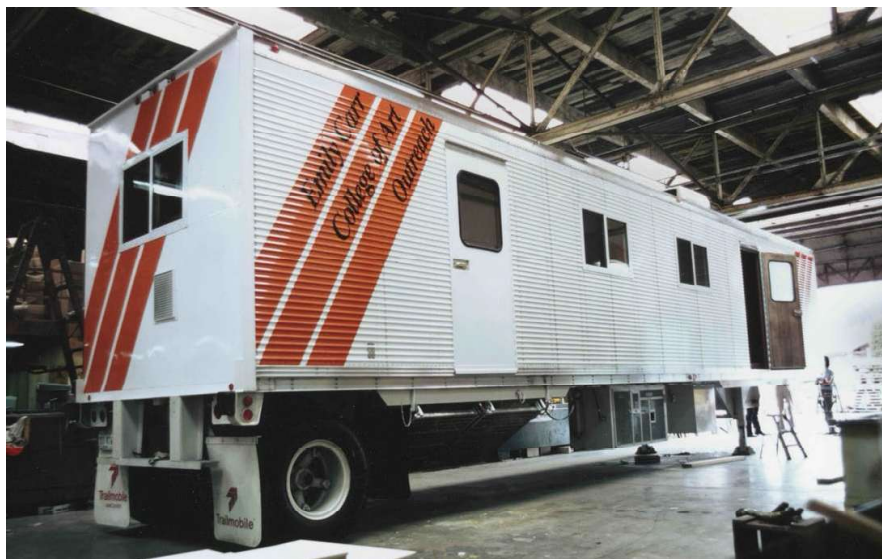
Printmobile, ECCAD Outreach program, 1979.

On view at the Libby Leshgold Gallery in support of ECU 100 th anniversary, En Route: mobile forms of art and education highlights historical and contemporary source materials, media and artworks from 1979–1985, and explores the importance of artist-led classrooms and informal learning environments and the impacts and legacies they have had across communities. For example, the travelling Printmobile brought art education to communities across British Columbia. In operation for seven years, this program was a traveling service aimed at expanding creative learning beyond the traditional classroom. Other projects presented include distance-learning telecourses and a touring BC Young Artists Biennial.